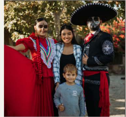
Día de Muertos Day of the Dead