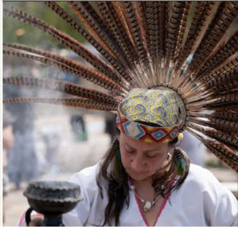
Recibe a la Primavera Welcoming Spring