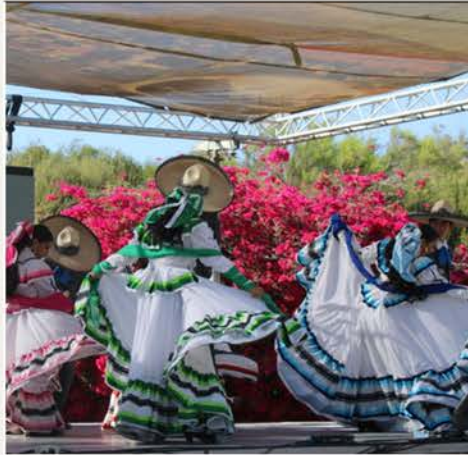
Día Mundial del Medio Ambiente World Environment Day