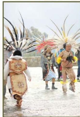
Upper left: Parque del Profesor, 1989